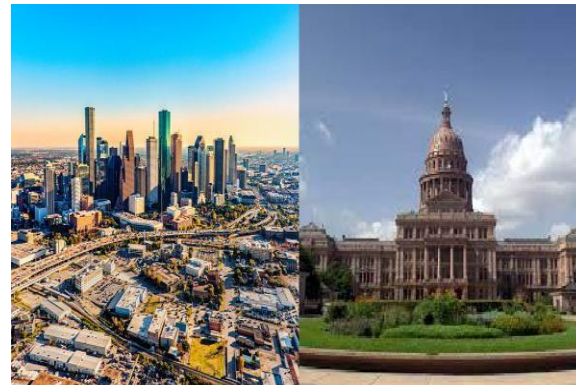
Texas (Houston, Austin, Dallas)