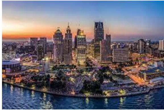
Michigan (Detroit, Lansing, Grand Rapids)