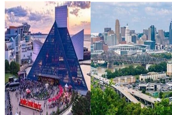
Ohio (Cleveland, Columbus, Cincinnati)