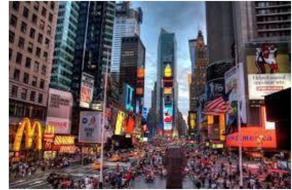
New York (New York City)